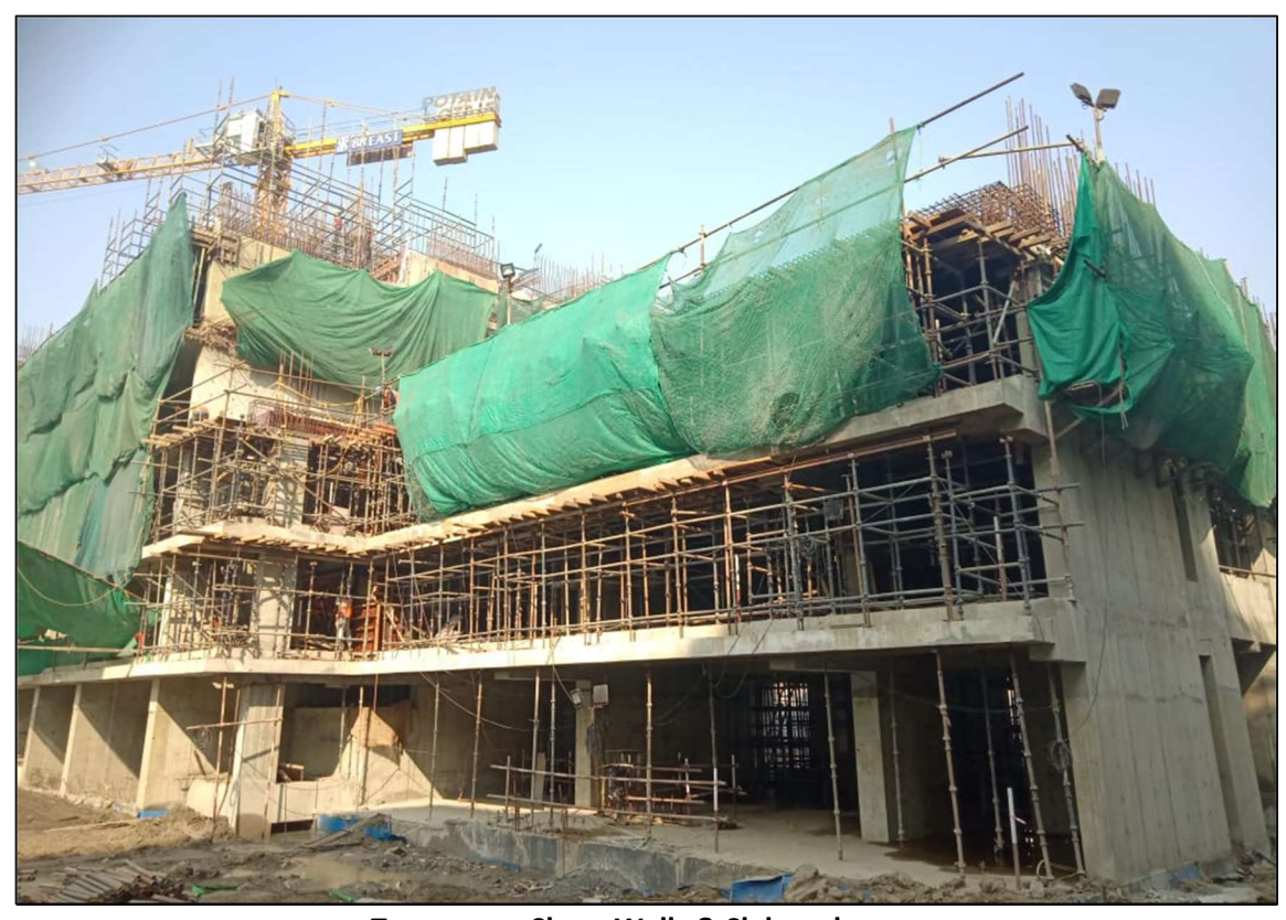
Tower area Shear Walls & Slab under progress