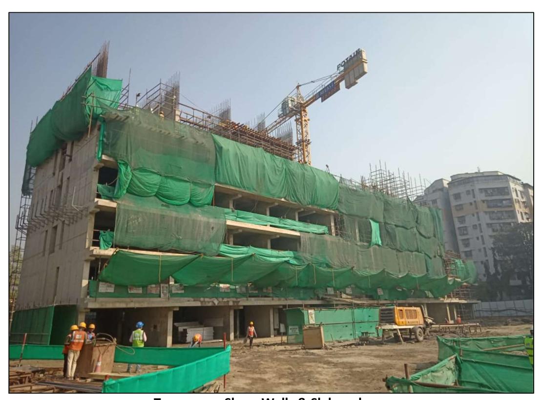
Tower area Shear Walls & Slab under progress