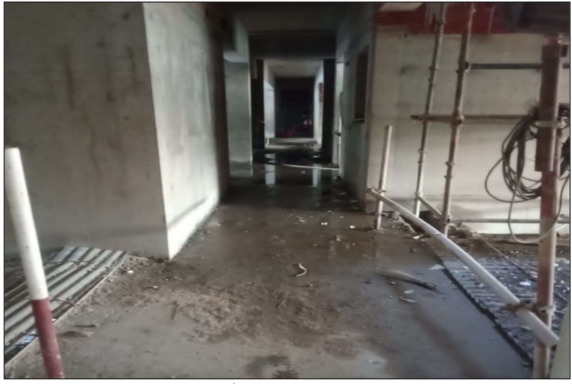
1<sup>st</sup> Floor works under progress