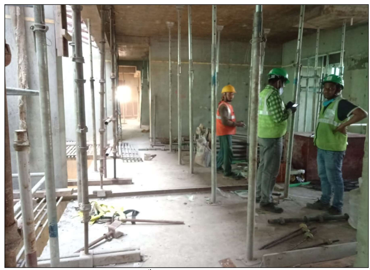
4<sup>th</sup> Floor works under progress