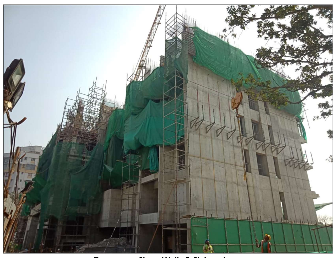
Tower area Shear Walls & Slab under progress