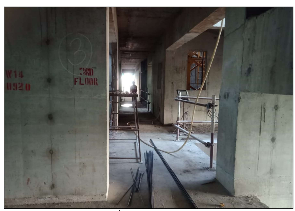
3<sup>rd</sup> Floor works under progress