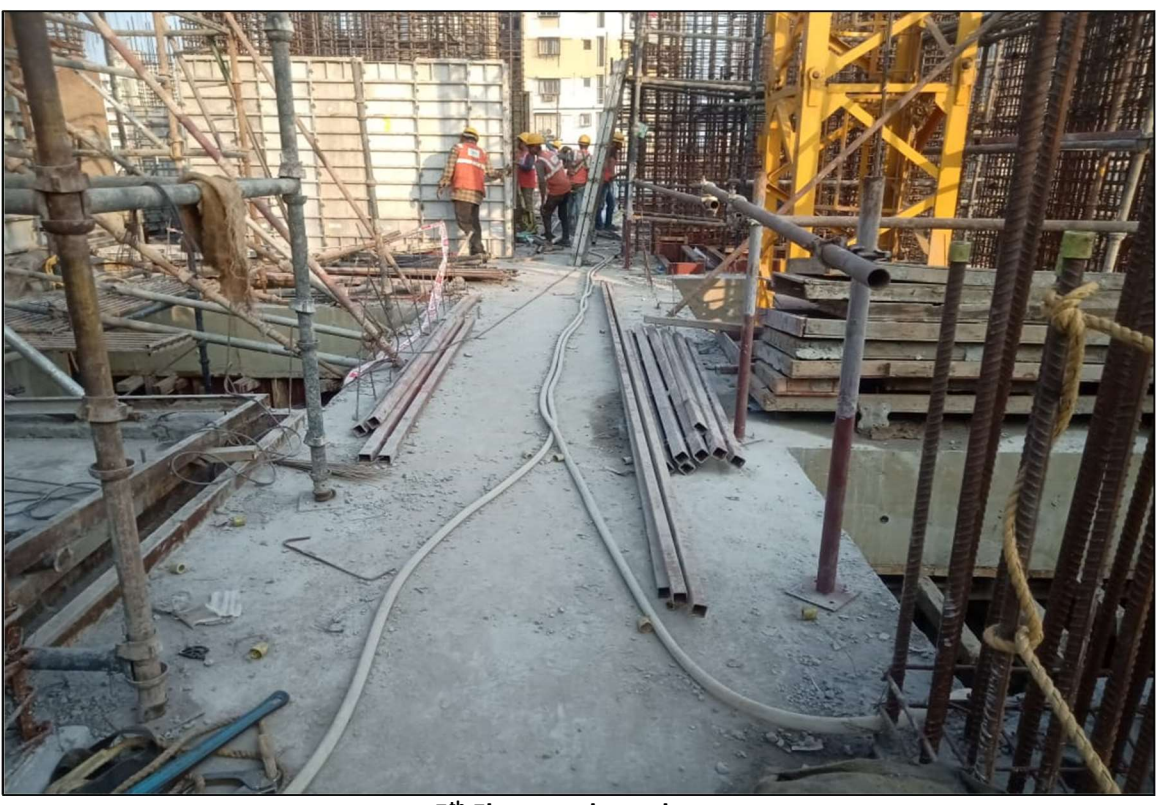
5<sup>th</sup> Floor works under progress