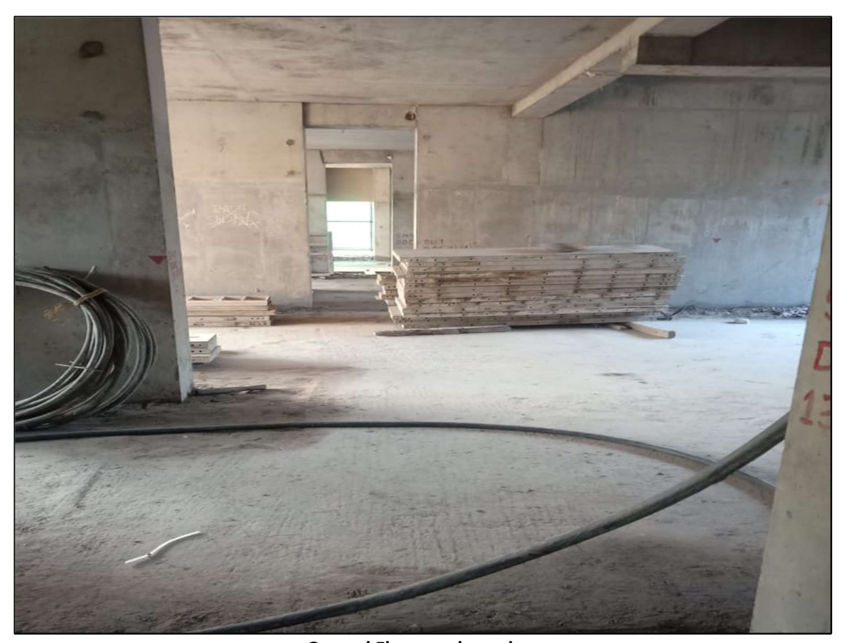
Ground Floor works under progress